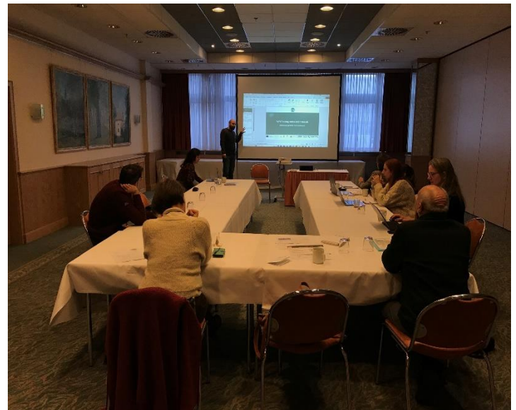
Image 3 The 3 rd Transnational Partners Meeting

The content of this publication represents the views of the author only and is its sole responsibility. The European Commission does not accept any responsibility for use that may be made of the information it contains.