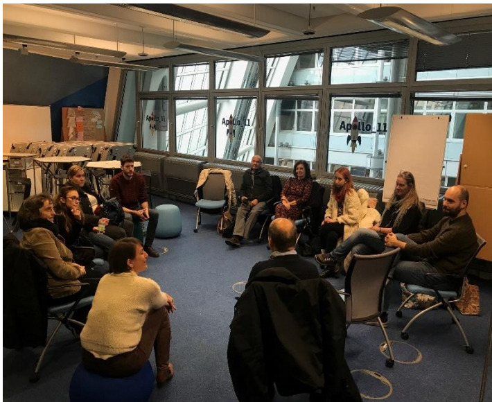
Image 2 Discussing in the Chamber of Commerce in Berlin

Based on the Best Practices Repository, the Meta-coin Consortium is now working on creating a structured working platform populated with training materials in meta-skills and internationalisation skills accessible at EQF-levels 3-6 providing an upskilling pathway. More specifically, the partners have completed the 2 nd working seminar and peer-learning activity taken place in Berlin in 28-30 th of November, where they worked on the structure and the methodology of the online course that will be available on the project’s website https://metacoinproject.eu/ .